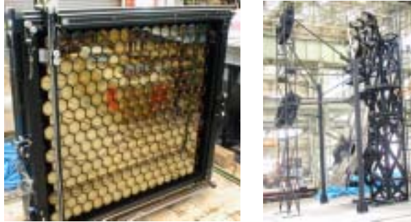
Fig. 1. The prototype camera and telescope reflector for the fluorescence measurement.

By one year operation of the hybrid-TA, we will collect \sim 12 events with E > 10^{20} \text{ eV} and more than 900 events with E > 10^{19} \text{ eV} , of which \sim 80 events are measured simultaneously by both the scintillation detector array and the air fluorescence telescopes.