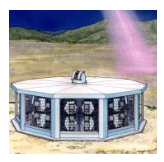
Fig. 1. The Hybrid TA (left panel) is composed of 576 plastic scintillation counters covering the ground area of 760 km<sup>2</sup> and 3 fluorescence telescope stations (right panel) surrounding the ground array and looking inward.

model also expects a concentration of the sources in the center of the galaxy. A realistic test of Lorentz invariance becomes possible when we identify the source objects of EHECR and measure the distance to the source. The detection of heavy nucleus as a major composition of the EHECR, on the other hand, excludes most of the particle physics origin and directly leads us to the shock wave acceleration. Thus, we expect the TA and the other next generation EHECR experiment will give a clear answer to many of these hypotheses.